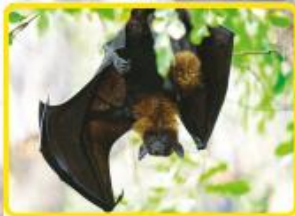
Bats Under the Bridge