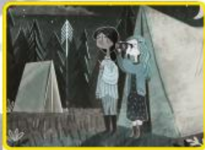
A Noise in the Night