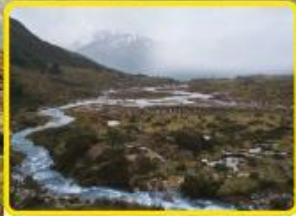
A Howl at Dusk