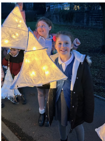
We held our Advent Lantern Service