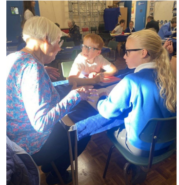
Serving the elderly in our local area with the Harvest Community Tea in October