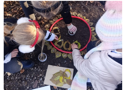
Incredible art in nature with artist Winston Plowes