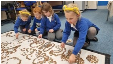
Pudsey pennies in November