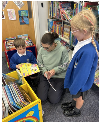
Some of us visited our local library on Woodfield Road