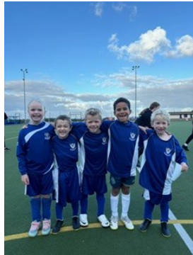
Multiple children have represented RTS in competitions hosted by Sporting Influence

We have squeezed a lot into our Autumn Term; more photos can be found on the school website gallery