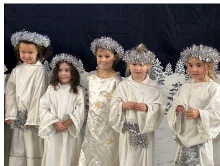
Hark! KS1 performed Everyone Loves a Baby!