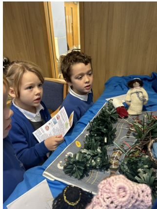
We visited the knitted Bible Exhibition