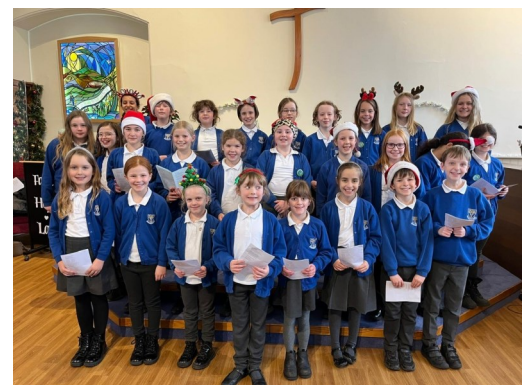
Our Choir sang everywhere